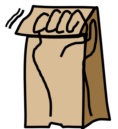
With bag over hand, move the puppet's mouth.