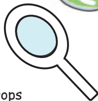
Ideas for Other Props