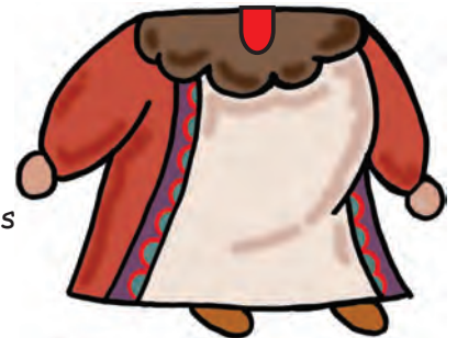
Glue on ROBE sides on to DRESS. Attach the HANDS and SHOES. Glue the BEARD at the top of the DRESS.