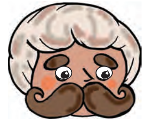
Glue on TURBAN, EYEBROWS, MUSTACHE (Draw or paste on a nose)